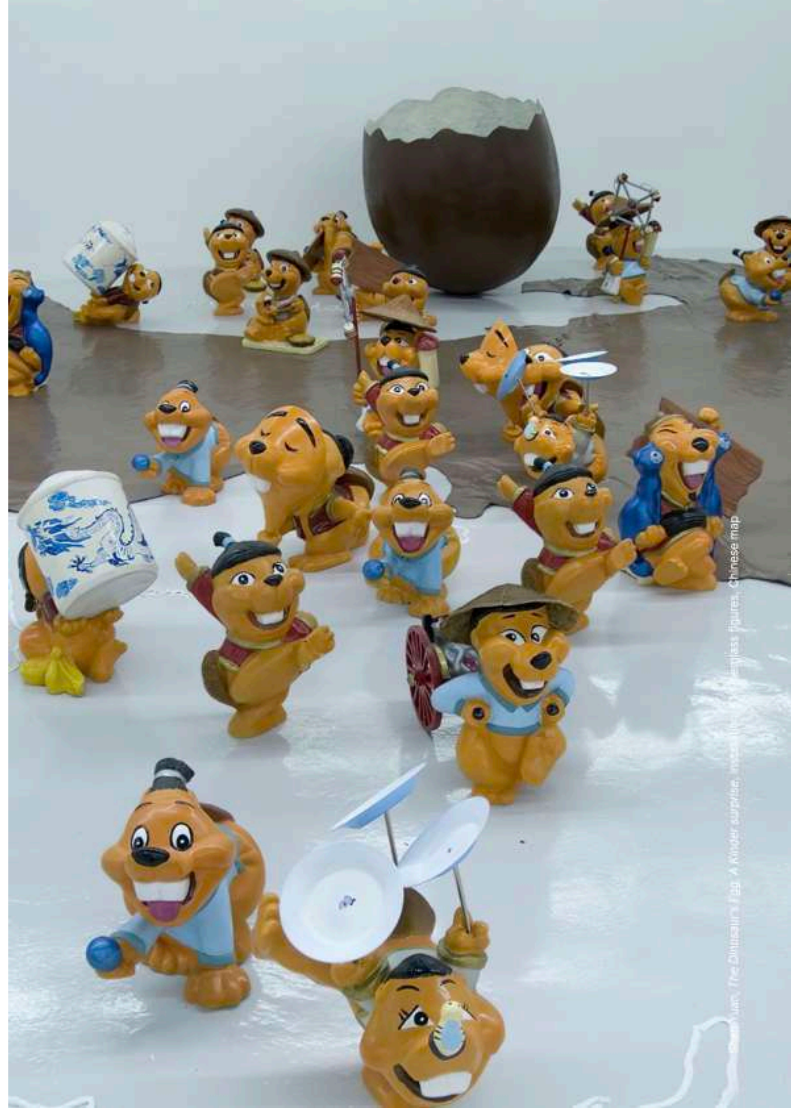
Sun Yuan, The Dinosaur's Egg. A Kinder surprise, accessible by glass figures, Chinese map

"We wanted to create a project that was open, accessible, and reflective of our times."