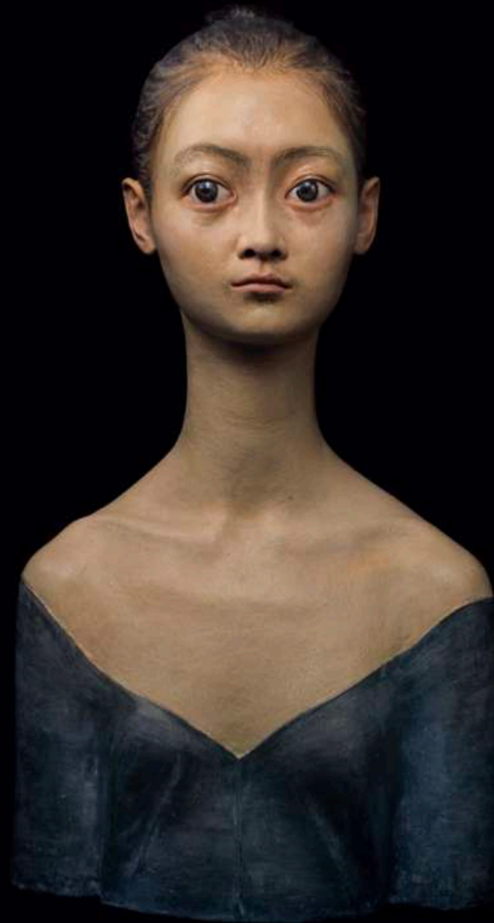
Li Wei: 真相 The truth 59x39x109cm 玻璃钢着色 painted fiber glass 2009