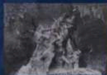
Cover artwork: ZHANG Yunyao, "Study in Figures", 2018